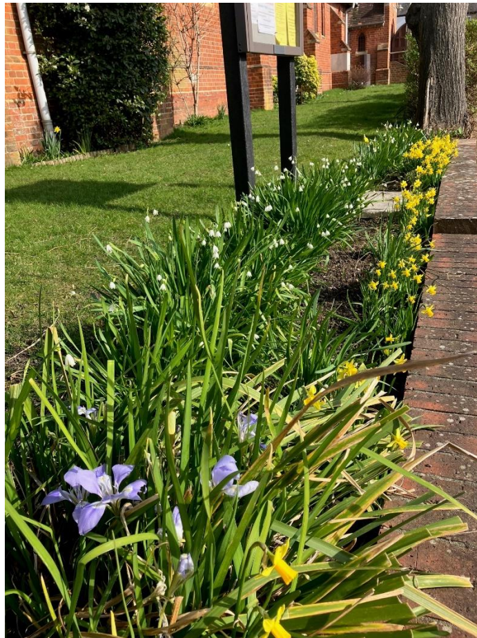
White 'snowflake' Leucojum, Tete-a-Tete miniature daffodils, blue Iris Stylosa – Brigid